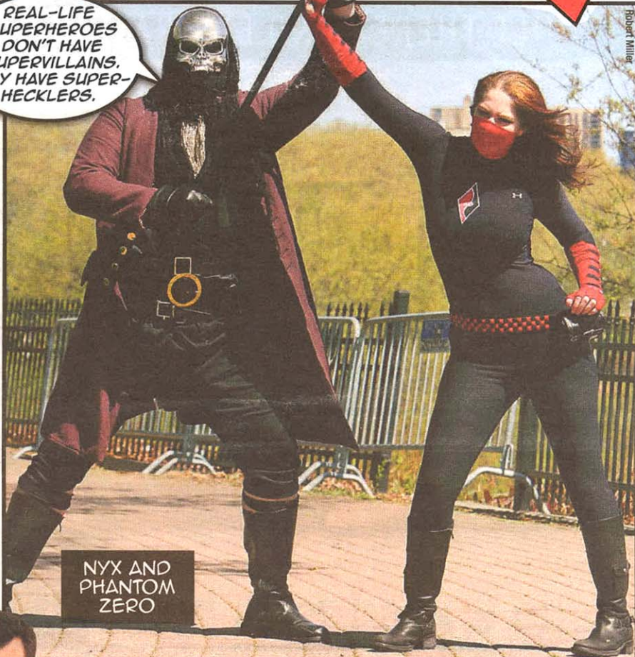
NYX AND PHANTOM ZERO

REAL-LIFE SUPERHEROES DON'T HAVE SUPERVILLAINS. THEY HAVE SUPER-HECKLERS.